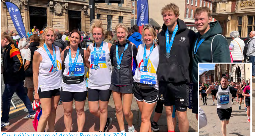
ur brilliant team of Arafest Runners for 2024

As well as the Summer Festival and the Christmas Charity Ball, the Arafest team also enter a team to run and raise funds in The Hull 10K every year.